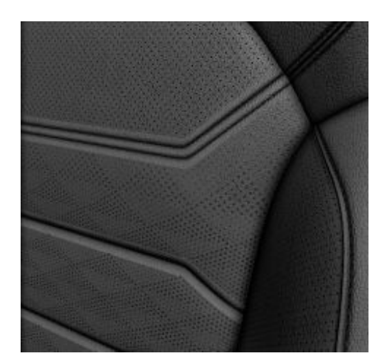
210TDI Elegance Soul Black Varenna leather appointed seat upholstery*