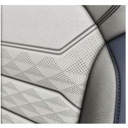
210TDI Elegance Optional Mistral two-tone Varenna leather appointed seat upholstery*#

Please note: Metallic (M) and Premium Metallic (PM) paint are optional at additional cost. *Leather appointed seats has a combination of genuine and artificial leather, but are not wholly leather