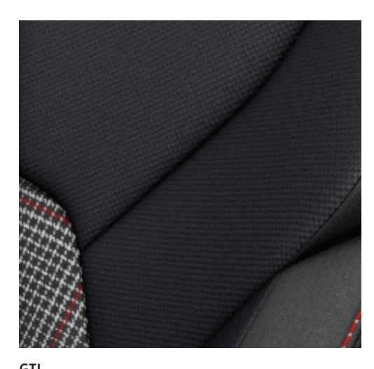
'Clark' GTI sports cloth seat upholstery