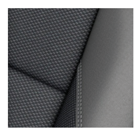
Black-Ceramique comfort sport cloth seat upholstery