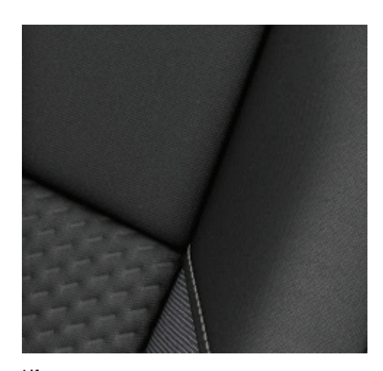
Black comfort cloth seat upholstery