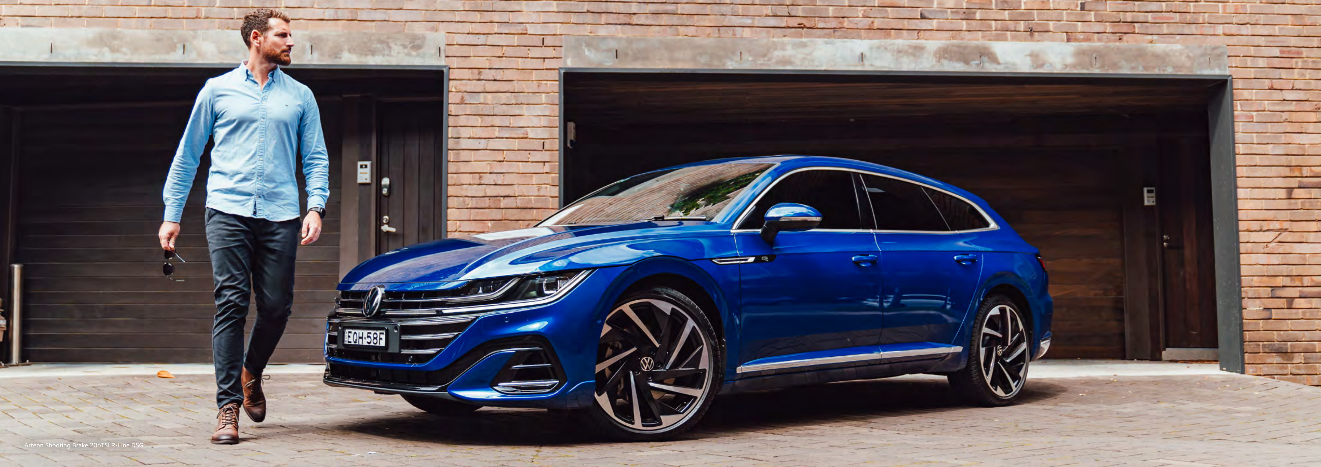
Arteon Shooting Brake 206TSI R-Line DSG