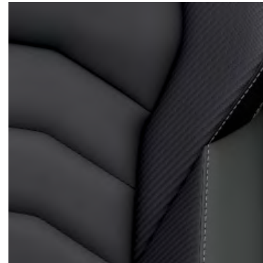
R-Line Black Carbon Nappa leather appointed seat upholstery*