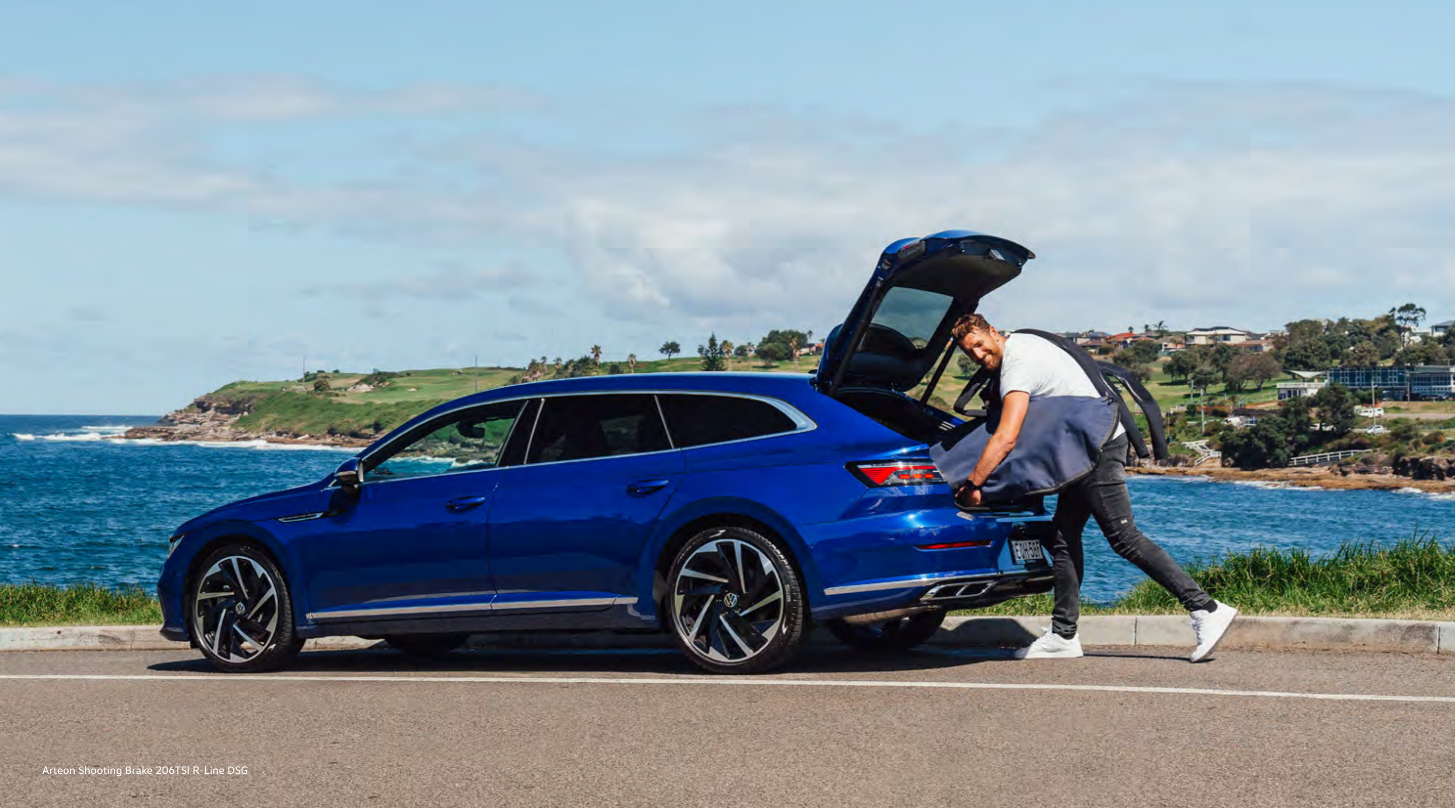
Arteon Shooting Brake 206TSI R-Line DSG