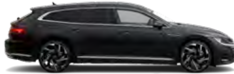
Manganese Grey M