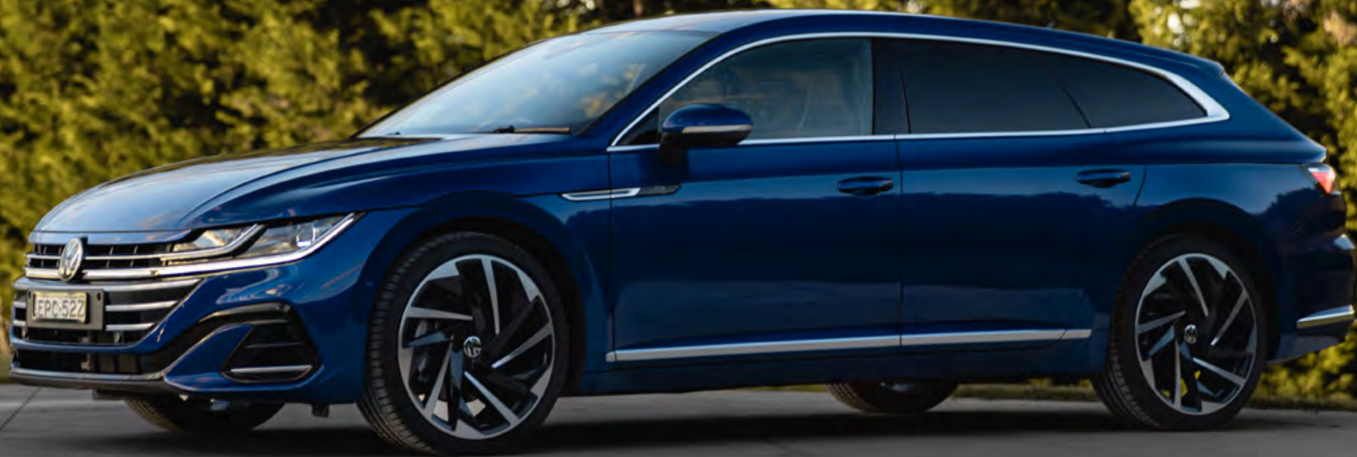
Arteon Shooting Brake 206TSI R-Line DSG