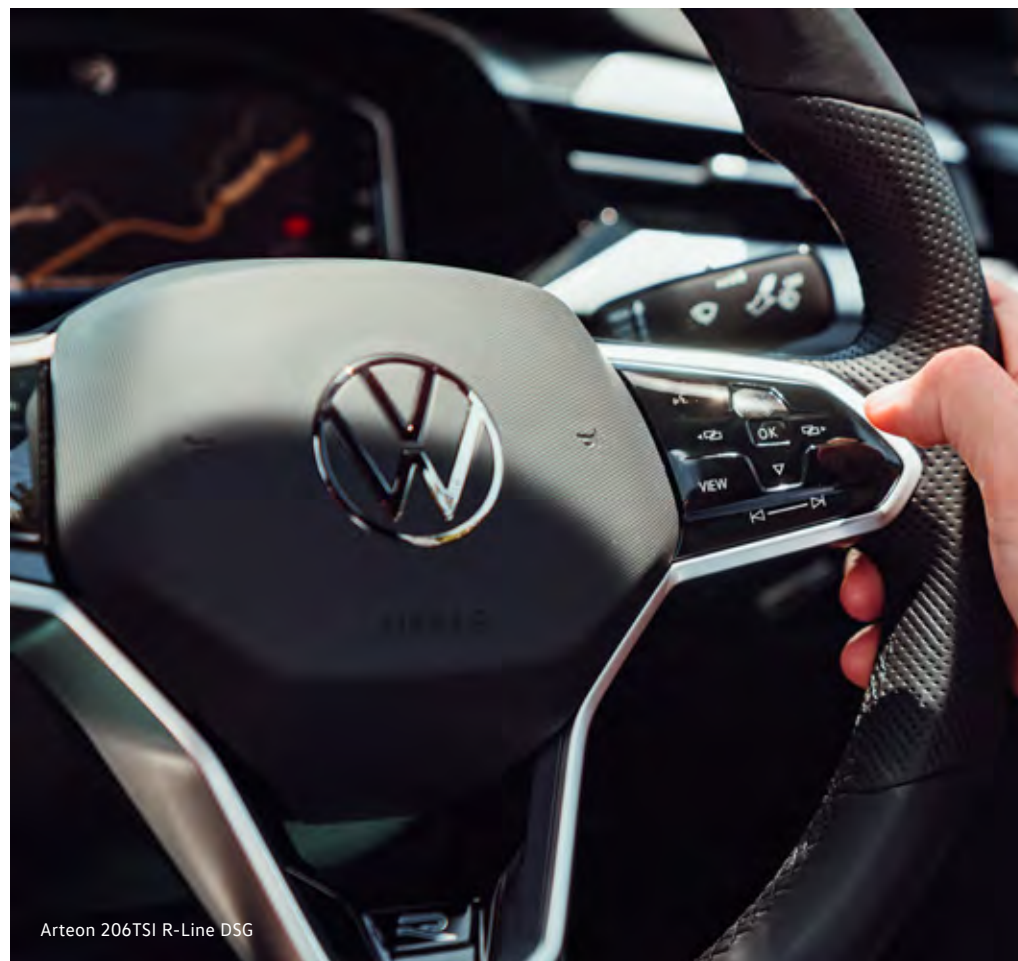
Arteon 206TSI R-Line DSG