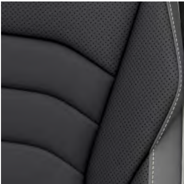
Titan Black Nappa leather appointed seat upholstery*