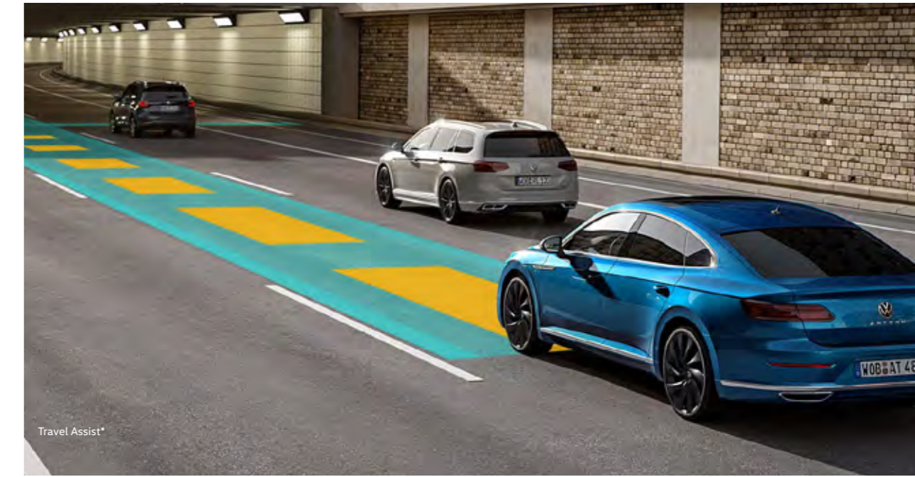
Travel Assist ^