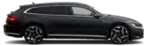
Manganese Grey M