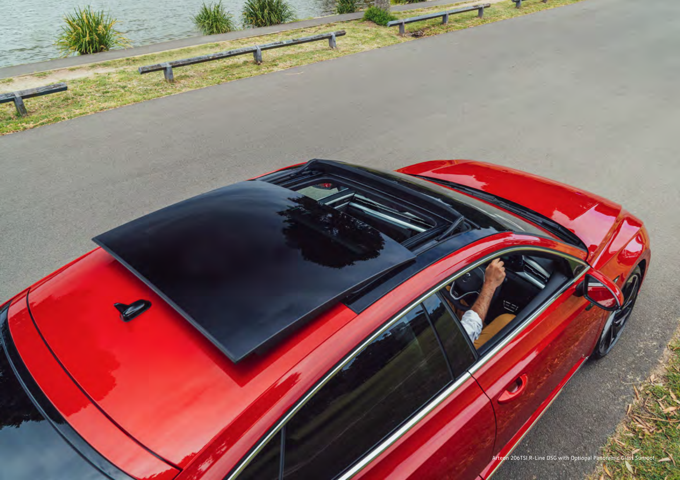
Arteon 206TSI R-Line DSG with Optional Panoramic Glass Sunroof