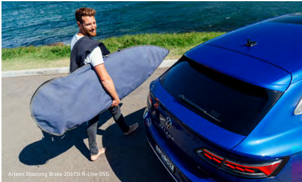
Arteon Shooting Brake 206TSI R-Line DSG