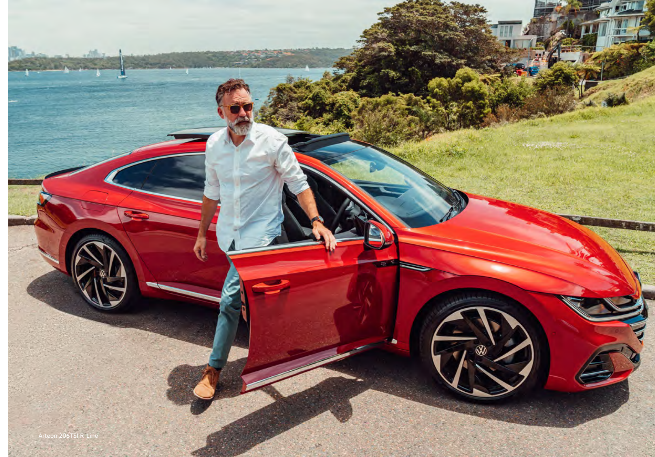
Arteon 206TSI R-Line