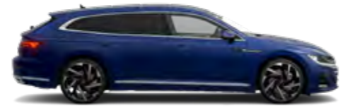
Lapiz Blue PM 2