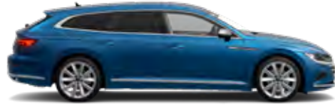
Kingfisher Blue M