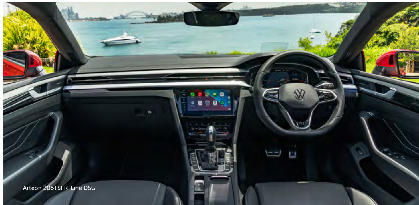
Arteon 206TSI R-Line DSG

For a gloriously light-filled cabin, an optional sunroof is available across the entire Arteon range.