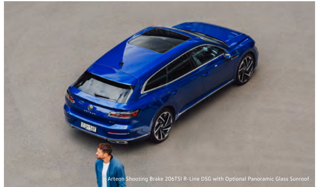
Arteon Shooting Brake 206TSI R-Line DSG with Optional Panoramic Glass Sunroof