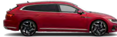
Kings Red PM