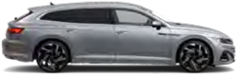
Pyrite Silver M