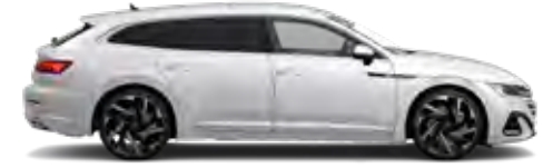
Oryx White PL