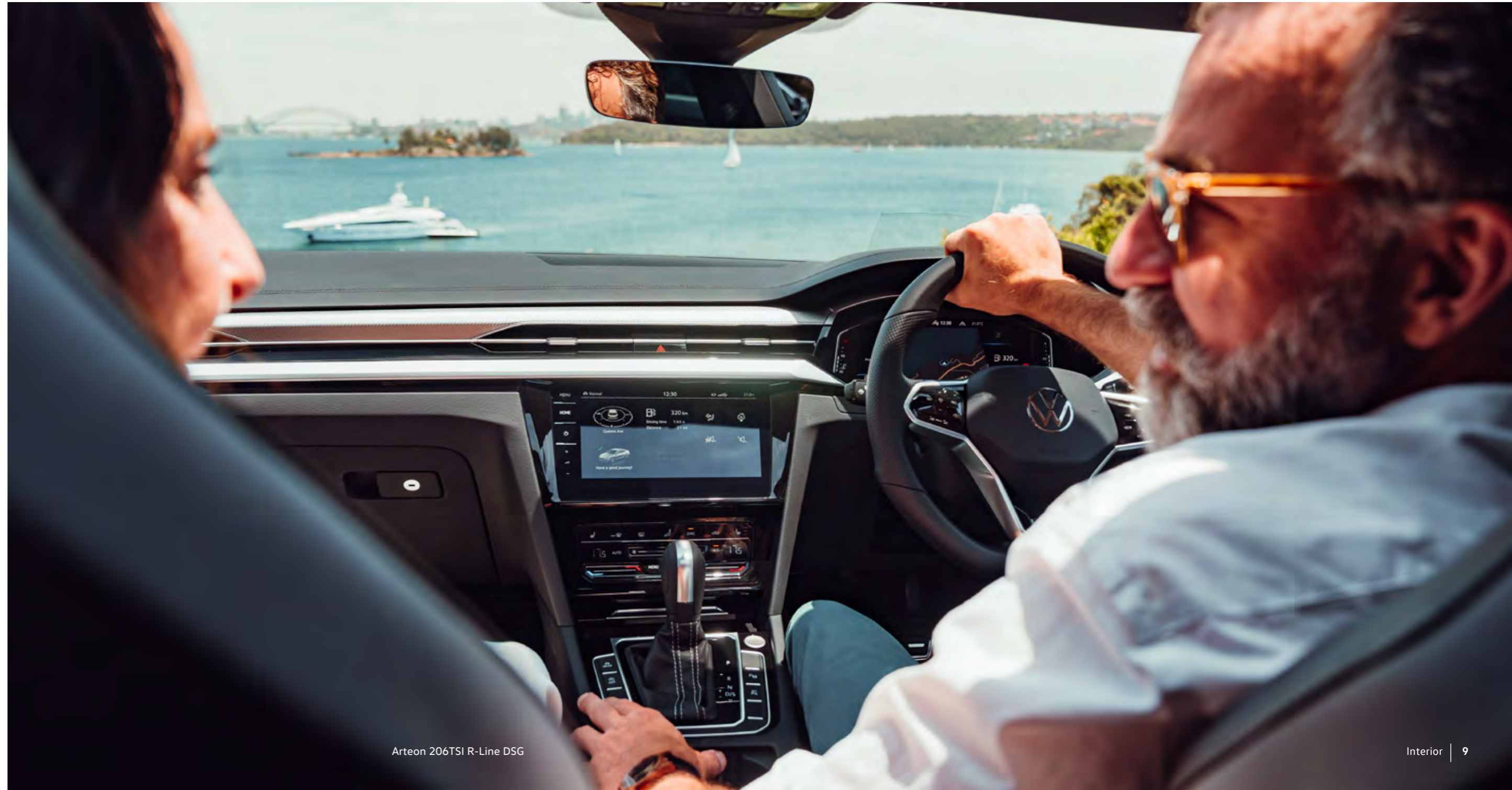
Arteon 206TSI R-Line DSG