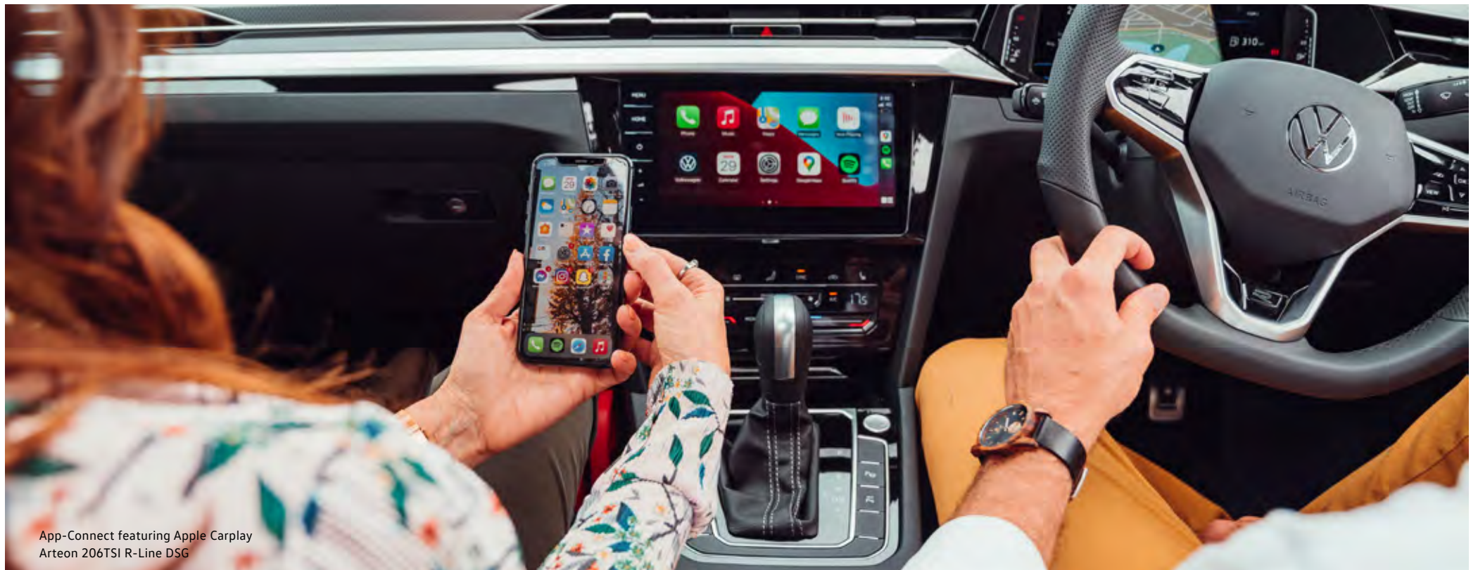
App-Connect featuring Apple Carplay Arteon 206TSI R-Line DSG

# Please note figures are sourced from overseas data where equipment levels by model variant may vary.