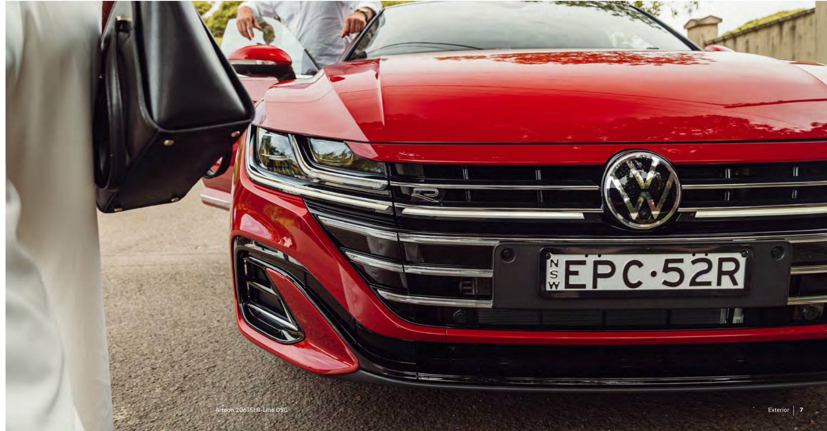
Arteon 206TSI R-Line DSG