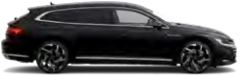
Deep Black PE