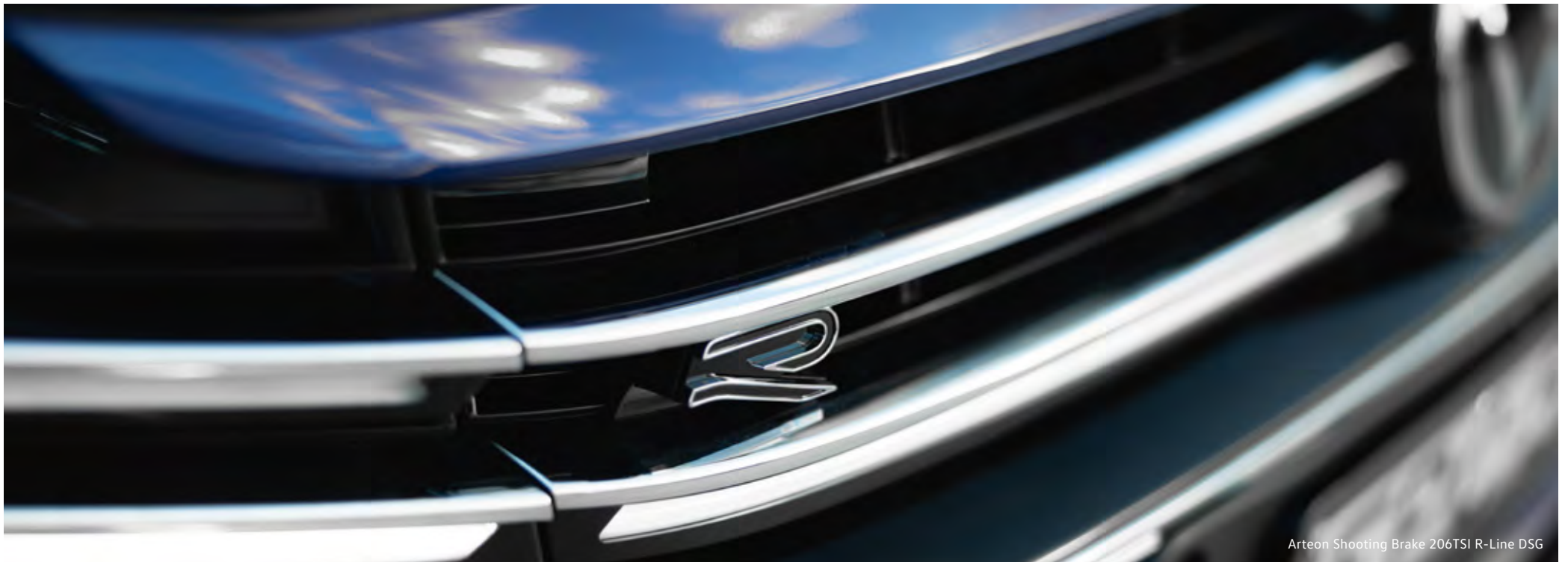
Arteon Shooting Brake 206TSI R-Line DSG