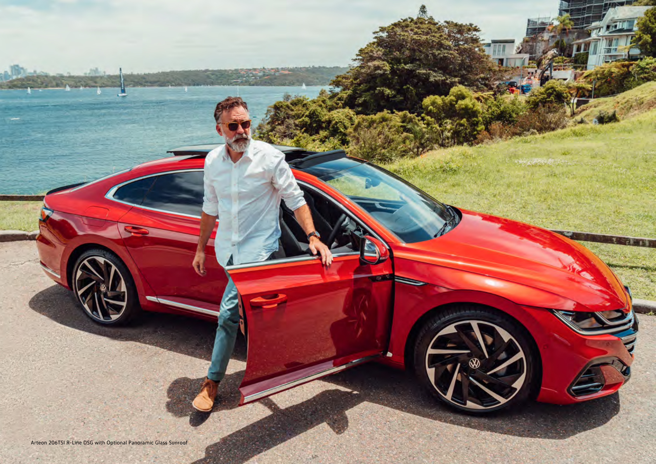
Arteon 206TSI R-Line DSG with Optional Panoramic Glass Sunroof