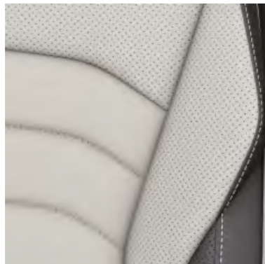
Mistral Nappa Leather appointed Seats* Optional on Arteon & Arteon Shooting Brake 140TSI Elegance