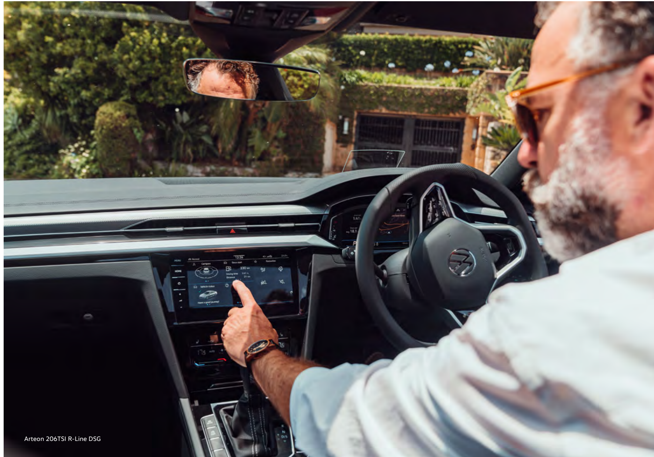
Arteon 206TSI R-Line DSG