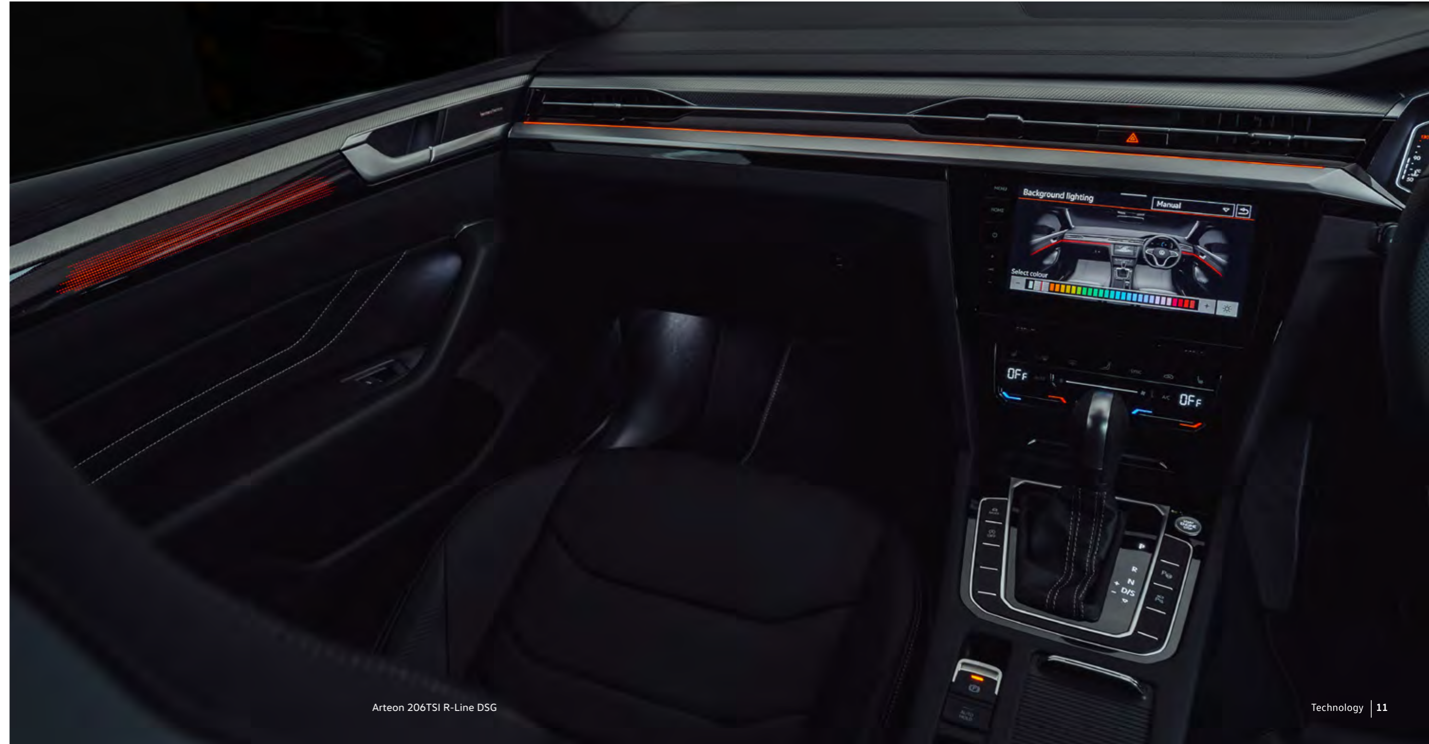
Arteon 206TSI R-Line DSG

-App-Connect featuring wireless Apple CarPlay® and wireless Android Auto™ is compatible with the latest versions of iOS and Android, active data service required, optional connection cable (sold separately).