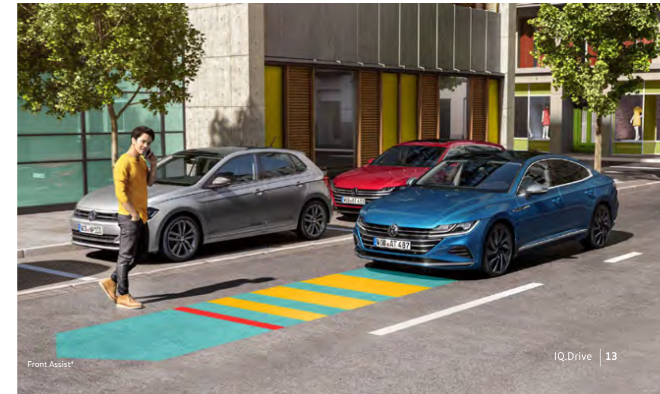
Front Assist ^