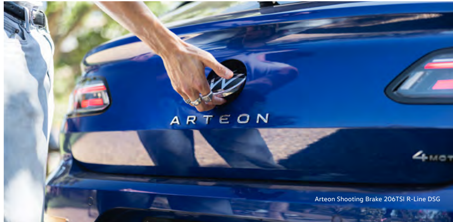
Arteon Shooting Brake 206TSI R-Line DSG

Volkswagen's R-Line vehicles are synonymous with sporty design, so it's no surprise the 206TSI R-Line should exhibit a number of subtly aggressive design features. Distinctive R-Line front and rear bumpers set the 206TSI R-Line apart from the 140TSI Elegance model, as does the prominent dual chrome exhaust trim at vehicle rear.