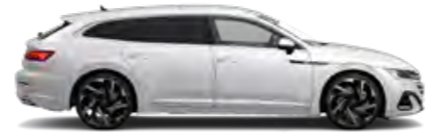
Oryx White PL