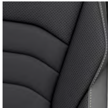
Titan Black Nappa Leather appointed seats* Standard on Arteon & Arteon Shooting Brake 140TSI Elegance