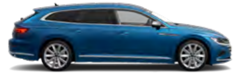
Kingfisher Blue M 1