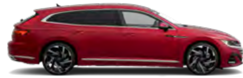
Kings Red PM