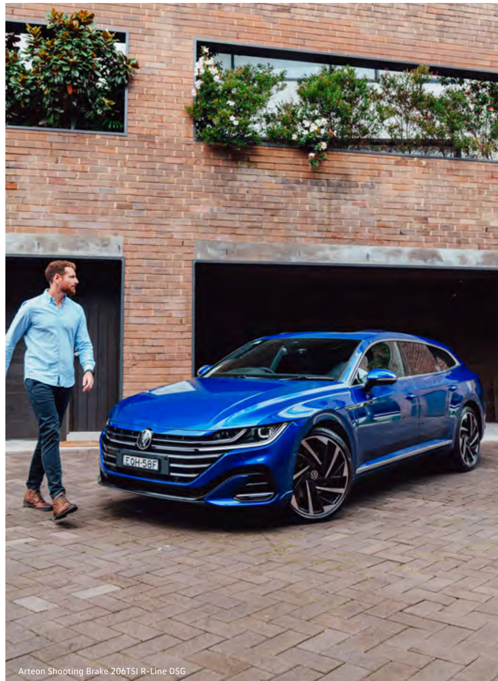
Arteon Shooting Brake 206TSI R-Line DSG