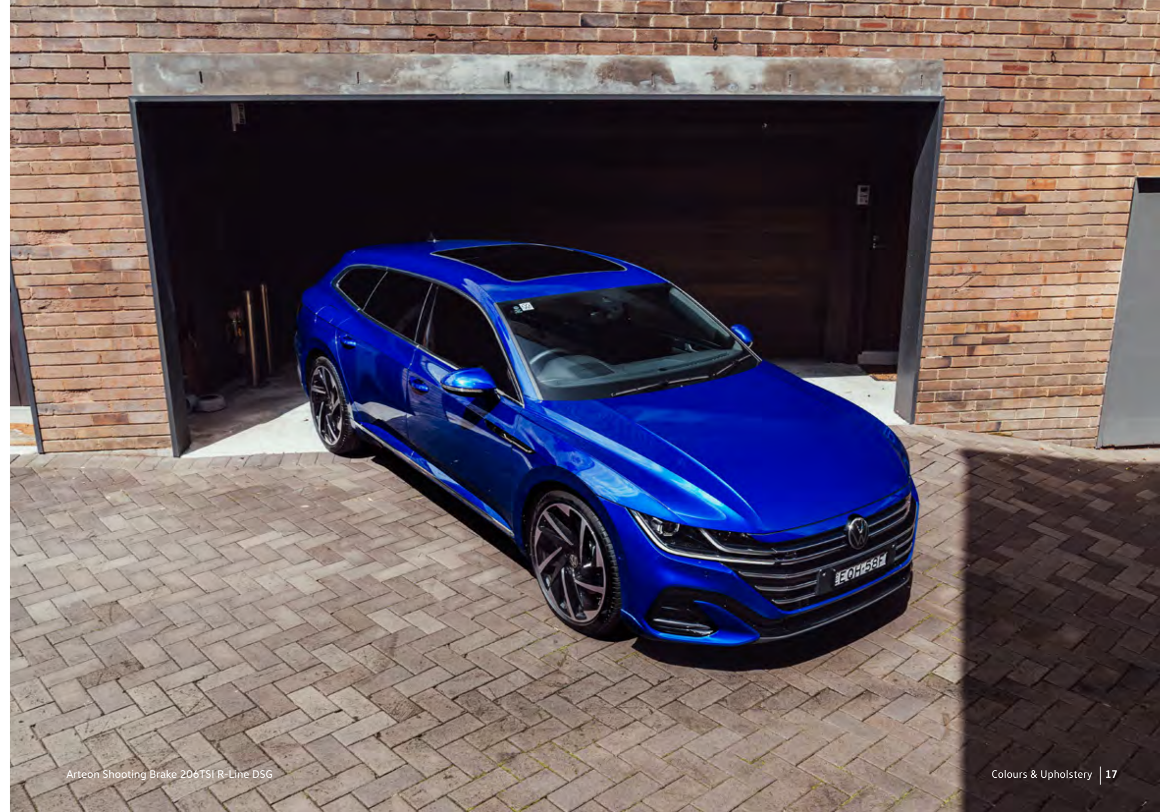
Arteon Shooting Brake 206TSI R-Line DSG

The print process does not allow for exact reproduction of the exterior or the upholstery colours. Please contact your Volkswagen Dealer for further information on colours and upholstery combinations