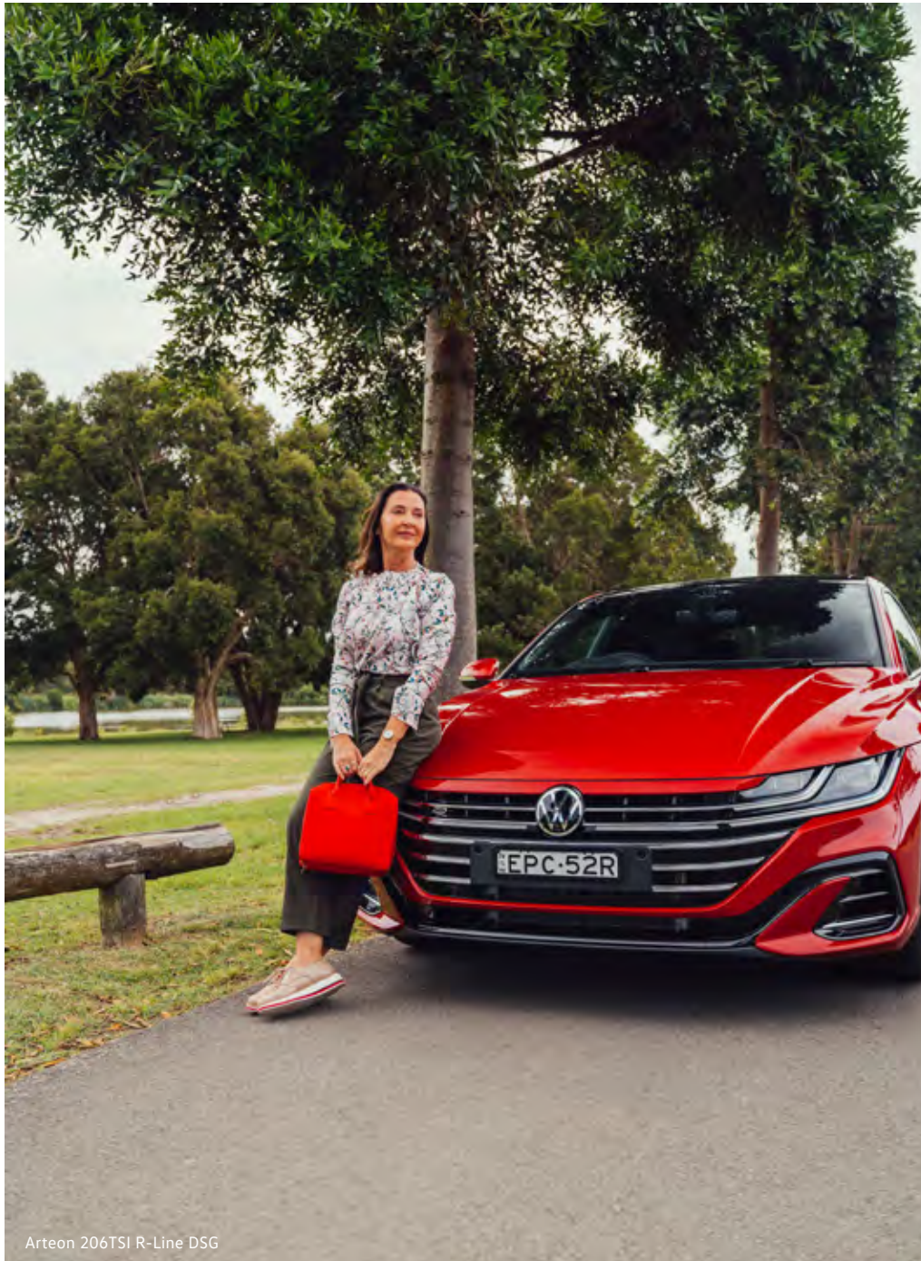
Arteon 206TSI R-Line DSG